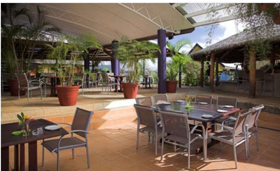
Restaurant and Bar

Moorings Hotel | Lini Highway. Port Vila, Efate Island, Vanuatu Tel +678 26800 | Fax +678 22172 | Email: gm@mooringsvanuatu.com