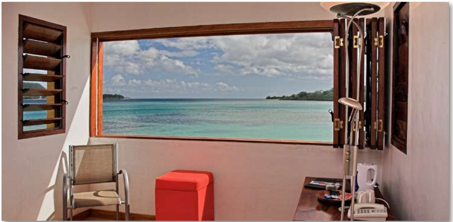
The Sea View