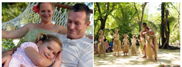
Our little Treasure's