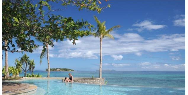
3 Pool swimming complex