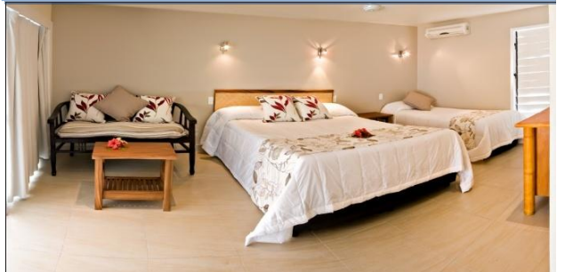
Ocean view & Beachfront bures