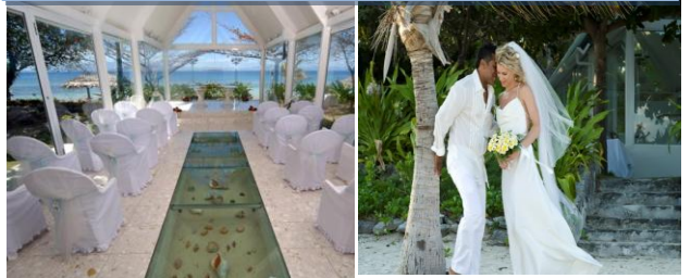
For weddings & romantic escapes